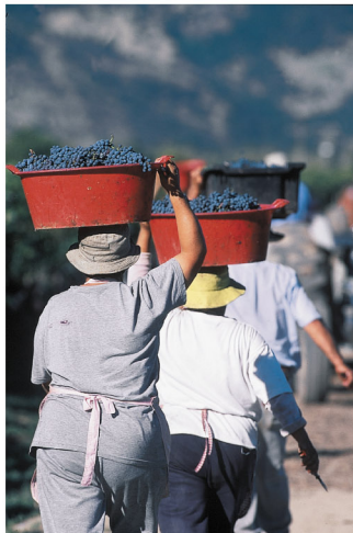
Cabernet grapes on their way to the winery